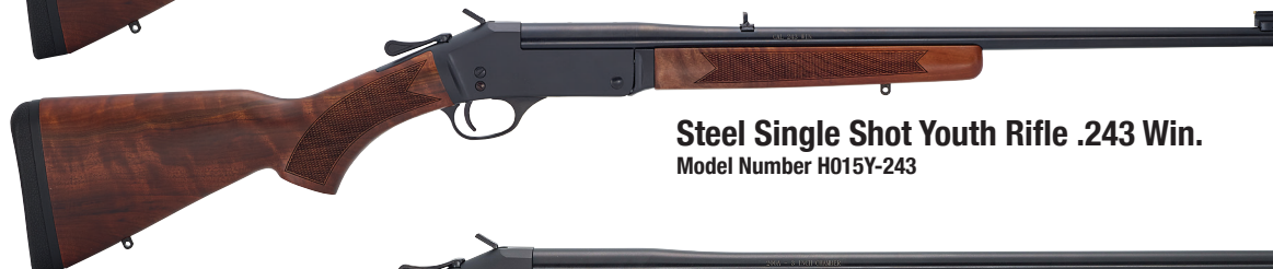
Steel Single Shot Youth Rifle .243 Win. Model Number H015Y-243