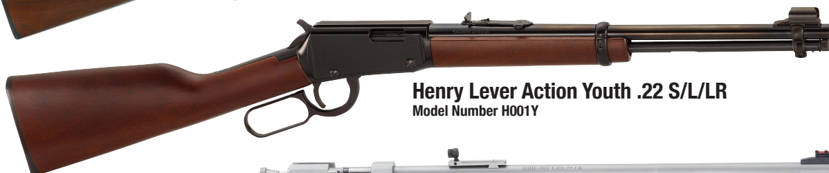
Henry Lever Action Youth .22 S/L/LR Model Number H001Y