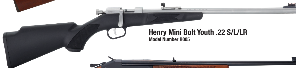
Henry Mini Bolt Youth .22 S/L/LR Model Number H005