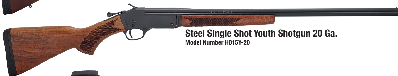
Steel Single Shot Youth Shotgun 20 Ga. Model Number H015Y-20