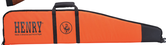
HCASE Henry 40" Gun Case Fits H001/H001T/H015/H015Y Model Number HCASE