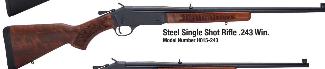
Steel Single Shot Rifle .243 Win. Model Number H015-243