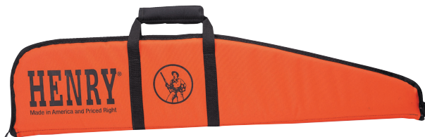
HCASE Henry 34" Gun Case Fits H001Y/H005 Model Number HCASEMB