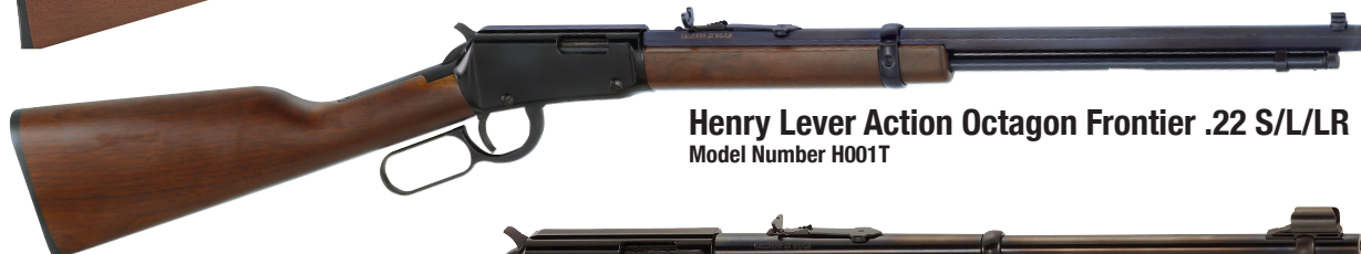
Henry Lever Action Octagon Frontier .22 S/L/LR Model Number H001T