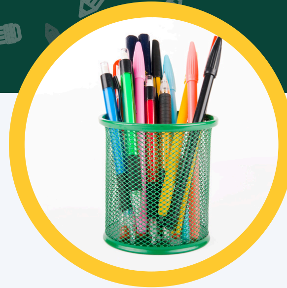
PENS AND PENCILS