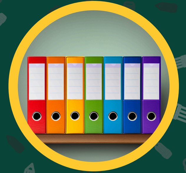
BINDERS WITH PLASTIC SLEEVES