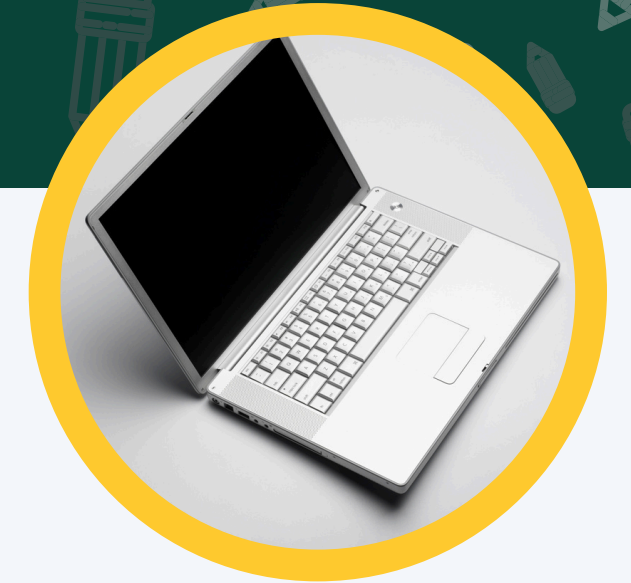
LAPTOP OR IPAD FOR SPREADSHEETS

These tools can help you keep track and stay organized as you record your data.